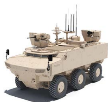
PARS IV 6x6 Personnel Carrier 2 x SANCAK RWS