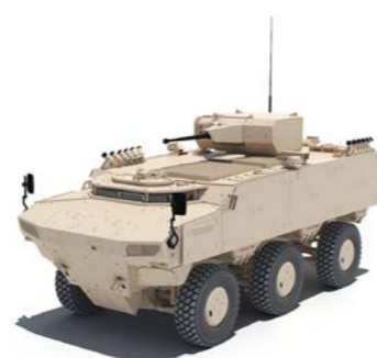
PARS IV 6x6 Fire Support Vehicle 25 mm SABER RCT