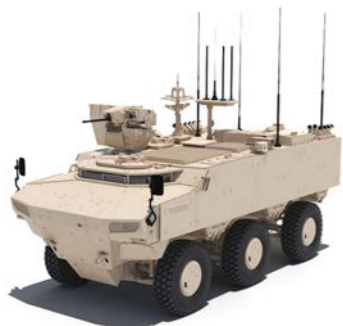
PARS IV 6x6 Command, Control and Signal Vehicle SANCAK RWS

The turrets are fitted with a universal weapon mount which enables them to carry 7.62 mm, or 12.7 mm machine guns, or 40 mm automatic grenade launchers, which can be easily changed depending on mission requirements. Two-axis stabilisation allows firing on the move and the high maximum elevation of the guns enables to engage targets on high grounds (building tops, cliffs etc) and/or low altitude aerial targets.