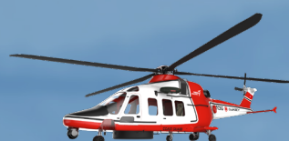
Search and Rescue